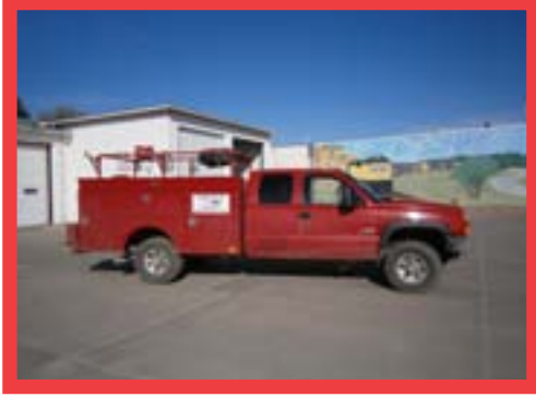
2006 Chevy 3500 Extended Cab 4x4, Duramax, Allison Tran. AC, PW, PD, with utility box, 175,000 miles, some hail damage