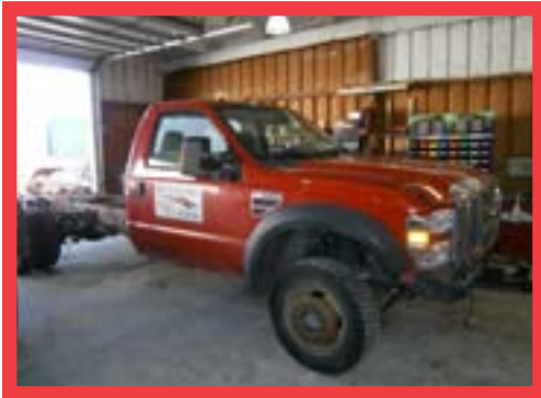
2008 Ford 5500 dually 4x4, 6.4 Power Stroke, AC, PW, PD, 110,000 miles, no bed, transfer case, or drive shaft. Needs lots of work.