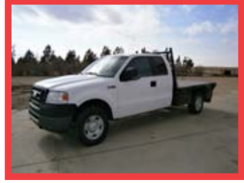
2006 Ford F-150 Extended Cab 4x4, 5.4 Titon, auto, AC, with flatbed, 133,500 miles, some hail damage