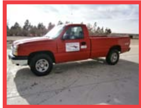
2003 Chevy Silverado 1/2 ton 4x4, 4.8 Vortec, auto, AC with 118,000 miles

All vehicles have been well maintained, but used.