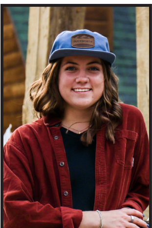
Maianna Siebert Burns Jr./Sr. High School