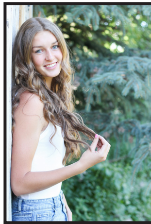
Emma Norris Burns Jr./Sr. High School