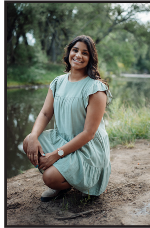
Daljit Kaur Burns Jr./Sr. High School