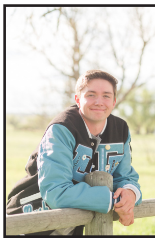
McCoy Bush East High School