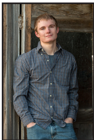
Hogan Allen Burns Jr./Sr. High School

Congratulations to each applicant as they continue their education and thank you to the panel of judges who took their time in selecting the applicants. Thank you to our members as well who invest in High West Energy. With your membership, we can support the surrounding communities through scholarships. Good luck to all the applicants with your future endeavors!