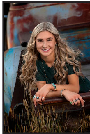
Katherine Olson Burns Jr./Sr. High School