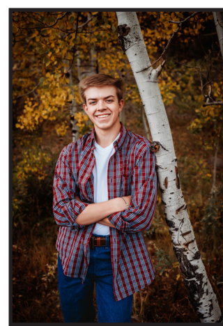
Clay Hancock East High School

Pine Bluffs Headquarters 6270 County Road 212 PO Box 519 Pine Bluffs, WY 82082 Monday-Thursday: 7:30 AM- 5 PM Closed on Fridays